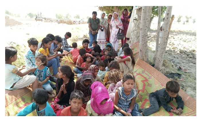
A new Sunday School was started

Delivering essential supplies to 9 distinct local churches that fell victim to mob violence, we extended our support to these affected congregations. Additionally, recognizing the dire circumstances of the community amidst house burnings, we distributed Bibles to ensure they have access to the comforting words of God during these trying times.