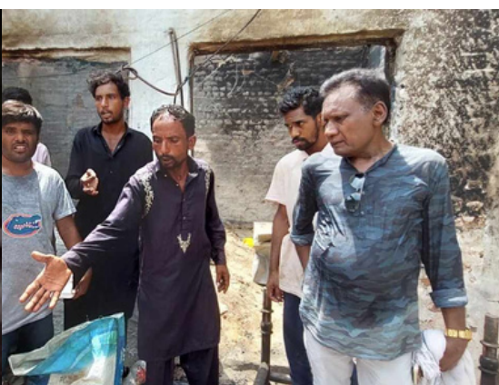
Urgent Prayer is needed for Christians in Pakistan